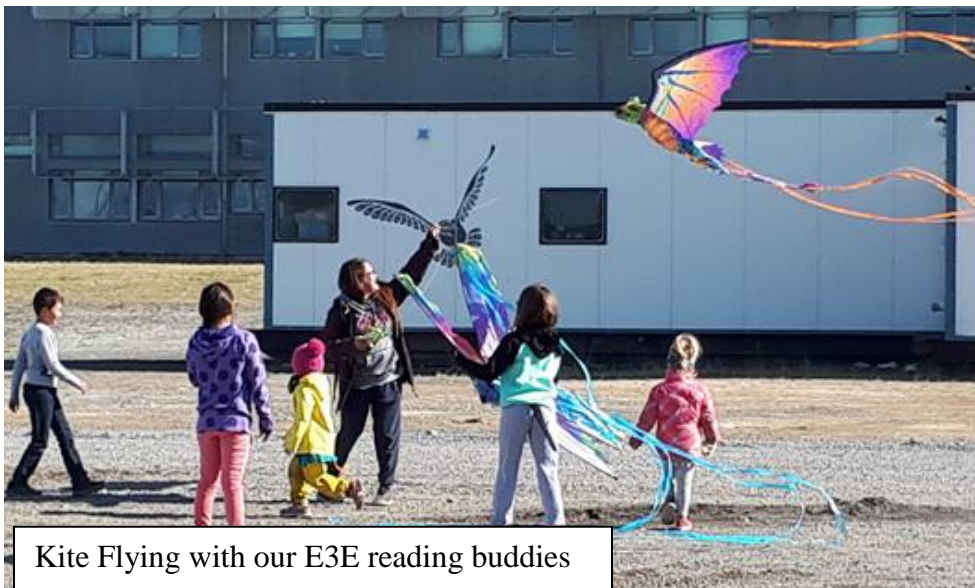
Kite Flying with our E3E reading buddies