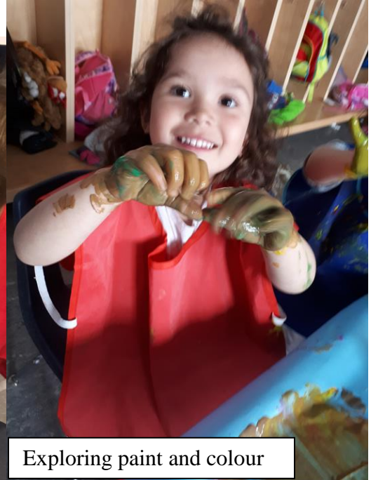
Exploring paint and colour