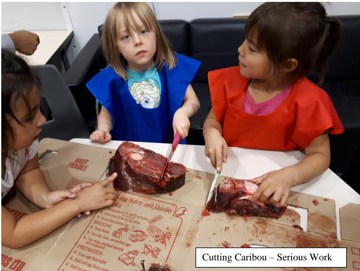
Cutting Caribou – Serious Work

Using the 8 points from our service vision we strive to provide accessible quality care and learning for children birth to 12 years of age. We have a strong emphasis on learning through play that natural incorporates culture, STEM and nature learning.