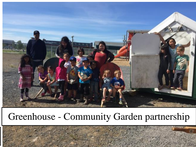
Greenhouse - Community Garden partnership

We continue to develop many strong partnerships with various organizations and departments. The following is a list of some of our ongoing partnerships. These too will increase as we continue to grow and strengthen our program.