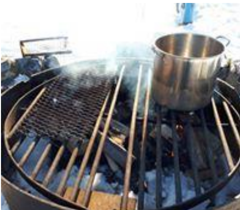
Community Tea & Bannock