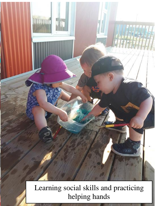
Learning social skills and practicing helping hands