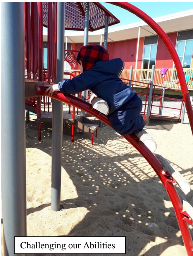
Challenging our Abilities

We are staffed to meet the needs of enrollment. Our programs remain full for the numbers the program rooms are staffed. When the waiting list gets large enough we hire another staff to meet the need. Our community drop in programs increased this year. This meant more children and families are able to access the Centre. We had a number of Aurora College student families using our in house subsidized rates this winter.