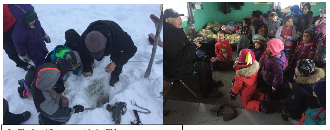
On The Land Program with the Elders