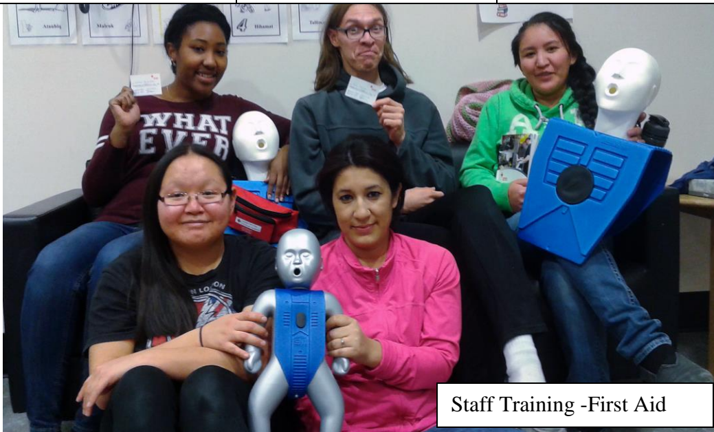
Staff Training -First Aid