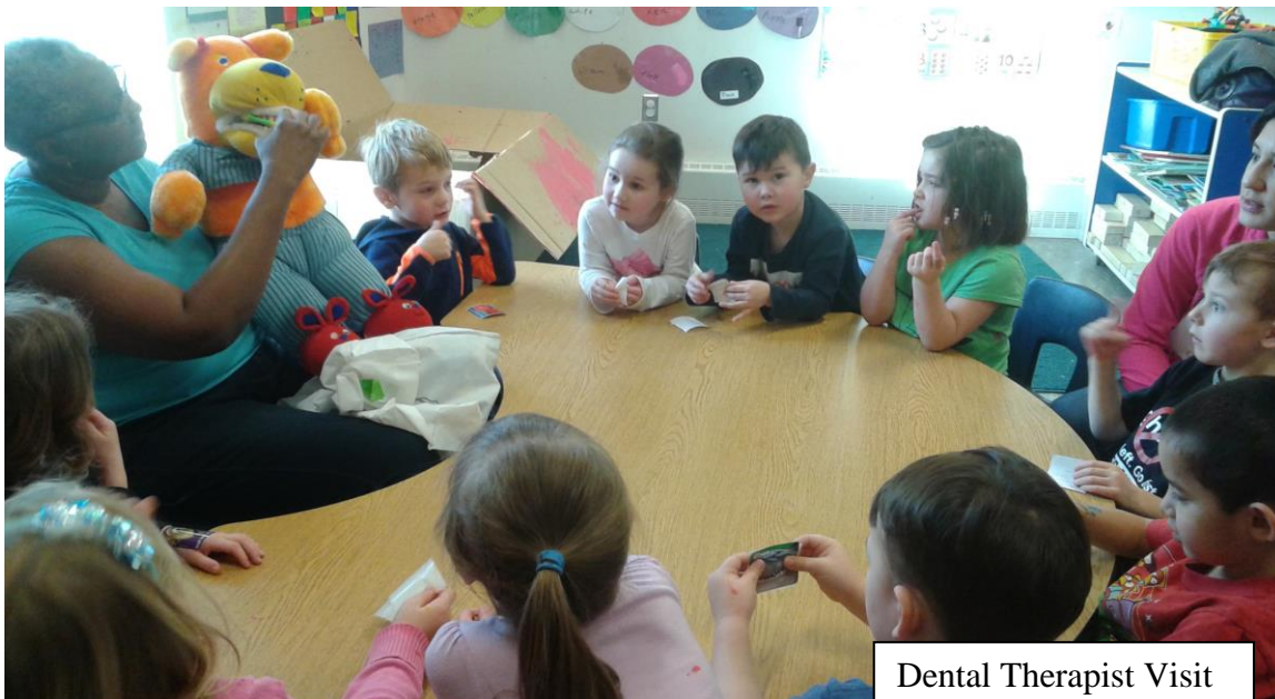
Dental Therapist Visit