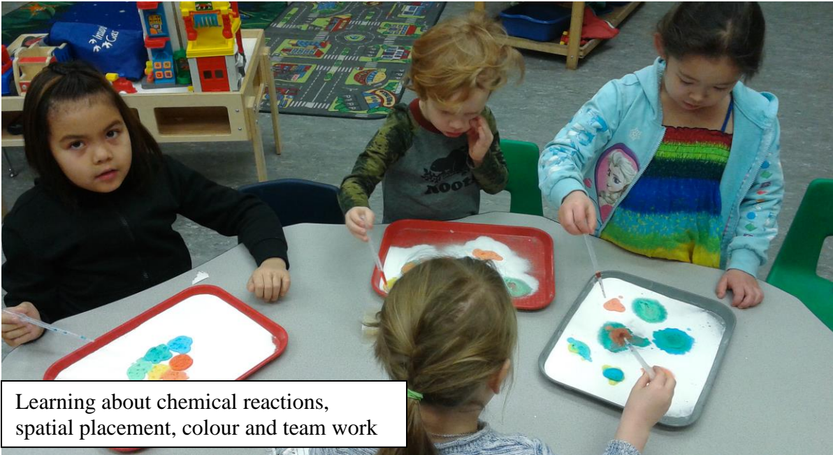
Learning about chemical reactions, spatial placement, colour and team work

We envision a future where happy and healthy children grow up to become healthy and happy adults who benefit Inuvik and society as a whole. The Children First Society's child development services help children to achieve their greatness!