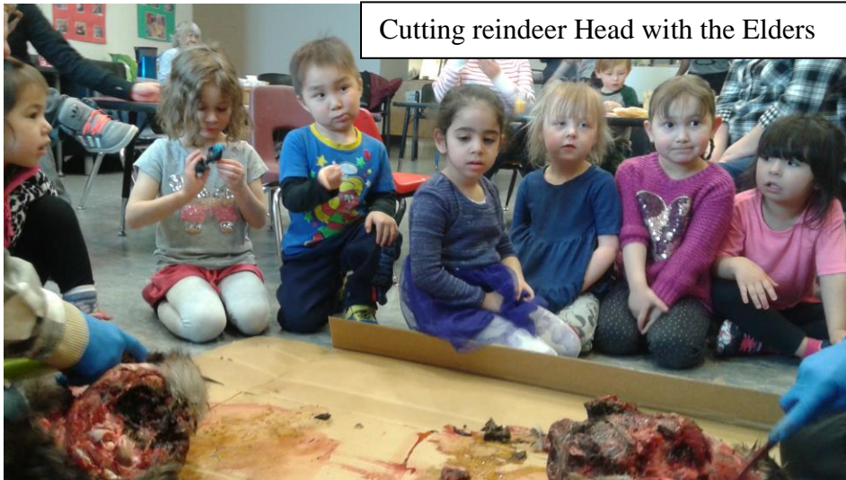
Cutting reindeer Head with the Elders

Using the 8 points from our service vision we strive to provide accessible quality care and learning for children birth to 12 years of age.